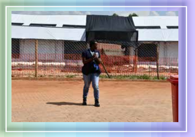
The EVD Children Isolation Unit.