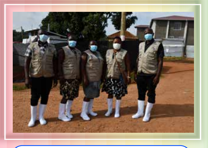
The Baylor-Uganda Mental Health and Psychosocial Team.