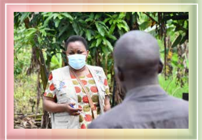
An Ebola survivor shares his story with a Mental Health and Psychosocial Support Counsellor during a home visit.