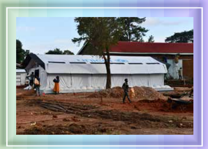
An Isolation Unit in Mubende district.