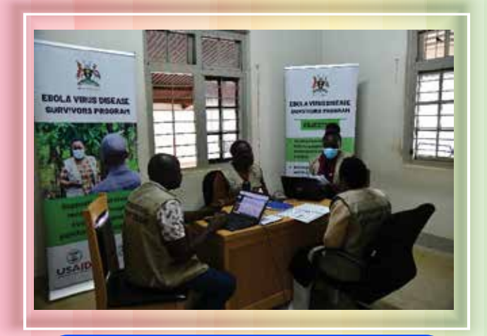
The psychosocial team during one of their brainstorming meetings before heading out for field visits.