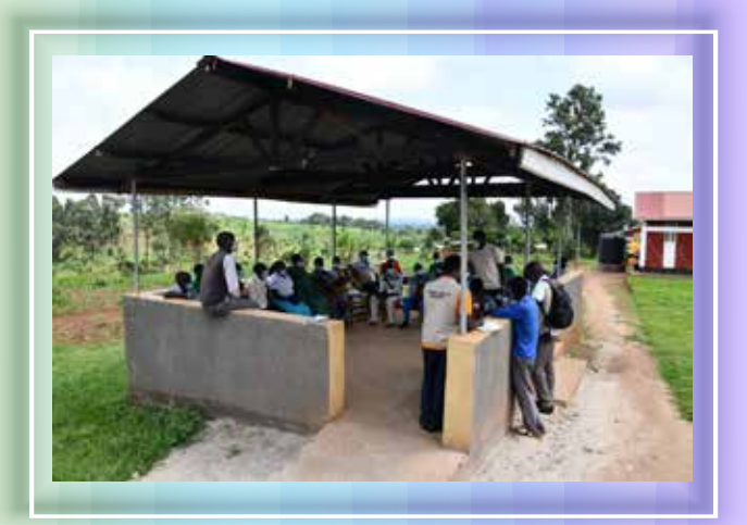
Training village health teams in Madudu.